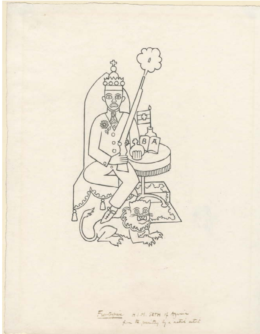
“Frontispiece: H. I. M. Seth of Azania from the painting by a native artist”

but equally important, is what I call the historical sense: I analyze the critical reception that the novel received in the Catholic press when it was first printed. For the controversy that emerged in 1933 offers a vantage point not only on Waugh's explicitly articulated ideas about satire and modernity, morality and fiction, but even more valuably, on the necessary contradictions that his method and mode forced upon him; it reveals the extent to which Waugh not only wrote, but was written by, satire. The transgressive satiric comedy of Black Mischief escapes the control of its own author and thus invites charges of immorality and cruelty, charges that for the rest of his life – indeed, even in death – would continue to dog the wag.