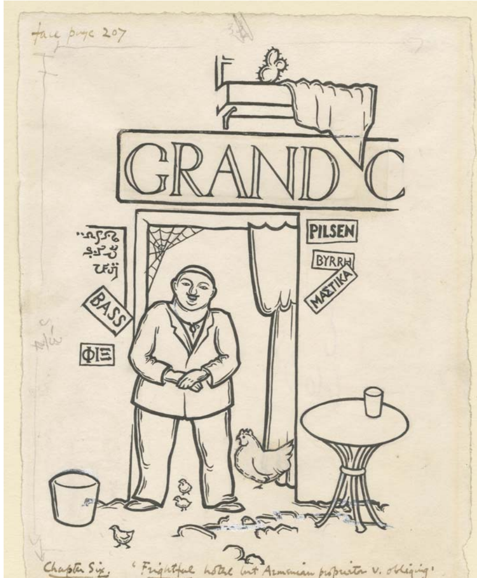
“Chapter Six: Frightful Hotel but Armenian proprietor very obliging”